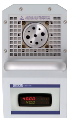
Temperature dry-well calibrator model CTD9100-450

These calibrators operate using Peltier elements and, as a result, can achieve testing temperatures below the ambient temperature. Due to their capacity for active cooling, they are often used in the biotechnology, pharmaceutical and food industries. The CTD9100-165-X features an enlarged insert with Ø 60 mm. Thus, it is possible to calibrate several temperature probes simultaneously without the need of changing the insert.