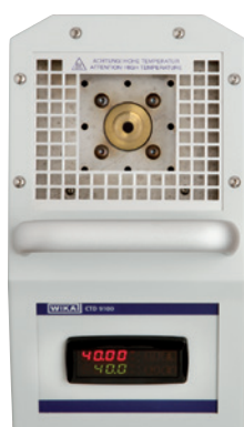
Temperature dry-well calibrator model CTD9100-650

The CTD9100-450 is used in the medium temperature range up to 450 °C. It generates its temperature with resistive electrical heating and features an enlarged insert with Ø 60 mm. Thus, it is possible to calibrate several temperature probes simultaneously without the need of changing the insert.