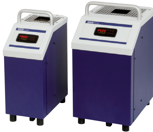
Temperature dry-well calibrators model CTD9100