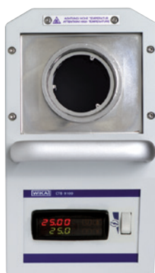
Micro calibration bath model CTB9100-225

This micro calibration bath is an efficient tool for the calibration of thermometers. It works with Peltier elements and can thus reach test temperatures below ambient temperature. New multistage Peltier elements ensure a good long-term stability and high reliability within the entire working range. Due to its capacity for active cooling, it is often used in biotechnology, pharmaceutical and food industries.