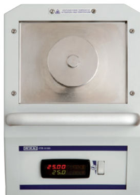
Micro calibration bath model CTB9100-165 with screw-on lid

Two instruments for the temperature range from -35 ... +255 °C (-31 ... +491 °F)