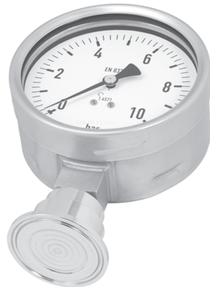
Diaphragm Seal, Clamp Connection Model 990.52 with Pressure Gauge Model 232.50 NS 100

KN 7 Glycerine, food compatible, FDA approved, per standard US Pharmacopoeia XXIV and European Pharmacopoeia (1998)